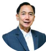
Dr. William Dar

Senior Vice Chair, WAF Board Biodiversity Scientist Former President, Republic of Mauritius Mauritius