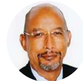
Dr. Ibrahim Mayaki

Indian Businesswomen, Philanthropist and Chairperson, Adani Foundation India